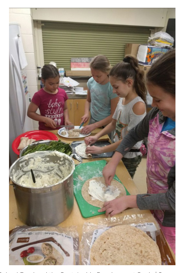
8 | School Food and the Sustainable Development Goals

sustainable development: the economic, social and environmental." This recognises that the goals cannot be attained individually or in isolation. This is a powerful concept that resonates strongly with an intervention like school food that is inherently multi-dimensional.